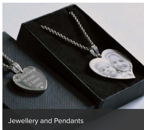
Jewellery and Pendants