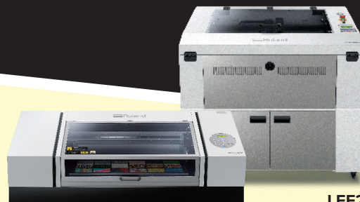
LEF2-300 / LV-290