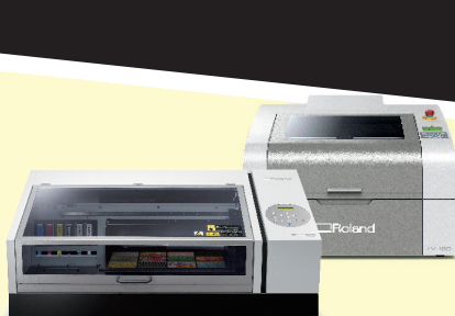
LEF2-200 / LV-180

With the VersaUV LEF2 series UV-LED printers, you can print amazingly photo-realistic colour, textures and simulated 3D embossing as well as gloss and matt finishes on objects and media up to 100 mm thick. When combined with the LV laser engraver, you have a powerful, integrated solution for creating premium-value custom items on demand. Quickly and easily produce jigs for items you want to print on your LEF to reduce set up times and ensure accurate print results.